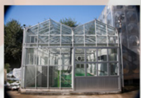
<Greenhouse for Demo and exhibition>